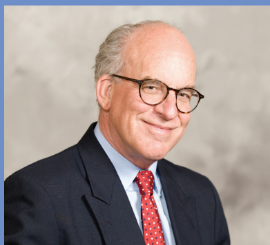
Breast Medical Oncologist

Since I was 8 years old I wanted to be a physician. My father was an orthopedic surgeon and I was drawn to the thrill of seeing young children who were crippled from polio and cerebral palsy successfully helped by my father's surgery. As I grew up I learned that these successes were attributed to a team of people; a surgeon, a nurse, a physical therapist, a psychologist, a brace maker, a parent and a teacher. It took a lifetime commitment of coordination and communication to help these children who suffered due to their chronic debilitation and rehabilitation needs, often with recurrent problems. When I decided to become an internist and then a medical oncologist, I remained compelled by the challenges to patients and their families dealing with chronic illness. So in 1982, when I became part of the first multidisciplinary breast center in California, the Van Nuys Breast Center, my childhood dream to substantively address the needs of patients suffering with life altering illness was actualized.