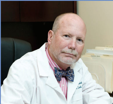
Breast Medical Oncologist

I feel so fortunate that I enjoy being a medical oncologist specializing in the care of women with breast disease. There was a time, when I was twenty that I questioned whether I would go into medicine. My beloved track coach at USC developed a fatal cancer and died during my sophomore year. Naturally I was devastated and I questioned whether I could become a physician. At that point I switched from pre-med and became an English major. As I matured over the next two years, I had second thoughts and decided I did desire to become a physician, but not a medical oncologist! Ironically, that is what I became. Ultimately, I decided if I was going to be a doctor, I wanted to make a difference in people's lives.